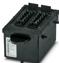
Replacement cleaning cartridge

https://www.phoenixcontact.com/us/products/1044350