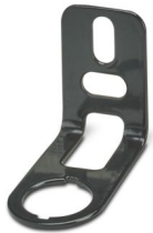
Metal bracket for products with M12 assembly thread

Please be informed that the data shown in this PDF document is generated from our online catalog. Please find the complete data in the user documentation. Our general terms of use for downloads are valid.