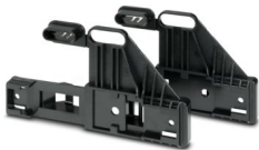
Mounting set for mast mounting

https://www.phoenixcontact.com/us/products/2230013