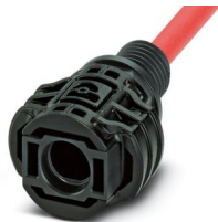
Device connector front mounting, Range of articles: SUNCLIX, housing material: PPE, color: black, Connection method: Crimp, Contact connection type: Pin, cable length: 130

https://www.phoenixcontact.com/us/products/1034752