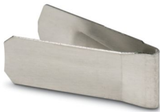
PCB safety clip

https://www.phoenixcontact.com/us/products/2230012