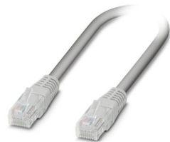
Patch cable, degree of protection: IP20, cable length: 25 m, number of positions: 8, 1 Gbps, CAT5, cable outlet: straight, Ethernet

Please be informed that the data shown in this PDF document is generated from our online catalog. Please find the complete data in the user documentation. Our general terms of use for downloads are valid.