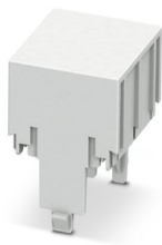
DIN rail housing, 2U, Housing cover, width: 18.9 mm, height: 21.8 mm, depth: 26 mm, color: light gray (similar RAL 7035)

Please be informed that the data shown in this PDF document is generated from our online catalog. Please find the complete data in the user documentation. Our general terms of use for downloads are valid.