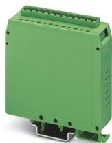
Electronic housing, for PCB insertion, with 12-pos. Combicon pin strip

Please be informed that the data shown in this PDF document is generated from our online catalog. Please find the complete data in the user documentation. Our general terms of use for downloads are valid.