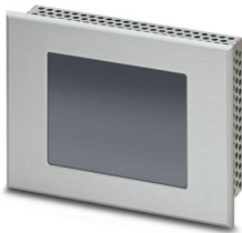
Web panel with 8.9 cm (3.5") graphics-capable TFT display, 320 x 240 pixels, 1x Ethernet, 2x USB, and integrated micro browser

Please be informed that the data shown in this PDF document is generated from our online catalog. Please find the complete data in the user documentation. Our general terms of use for downloads are valid.