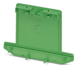
Side element, tall version, for closing both ends of the base element UM-BEFE, for 73 mm wide U-shaped profile cover

Please be informed that the data shown in this PDF document is generated from our online catalog. Please find the complete data in the user documentation. Our general terms of use for downloads are valid.