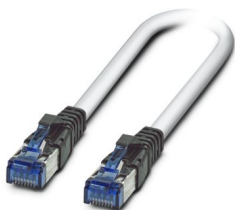
Patch cable, degree of protection: IP20, cable length: 12.5 m, number of positions: 8, 1 Gbps, CAT6, Ethernet

https://www.phoenixcontact.com/us/products/2891369