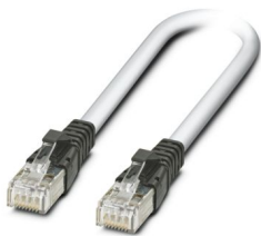
Patch cable, CAT5, assembled, 5 m

https://www.phoenixcontact.com/us/products/2832580