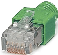
RJ45 connector, design: RJ45, degree of protection: IP20, number of positions: 8, 1 Gbps, CAT5 (IEC 11801:2002), material: Plastic, connection method: Crimp connection, connection cross section: AWG 26- 24, cable outlet: straight, color: gray, Ethernet

https://www.phoenixcontact.com/us/products/2744856