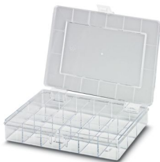
Assortment box, dimensions: 250 x 170 x 46 mm, 18 compartments, compartment size 1: 48 x 39 mm, compartment size 2: 66 x 39 mm

Please be informed that the data shown in this PDF document is generated from our online catalog. Please find the complete data in the user documentation. Our general terms of use for downloads are valid.