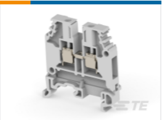
TE Part #1SNA115116R0700 M4/6