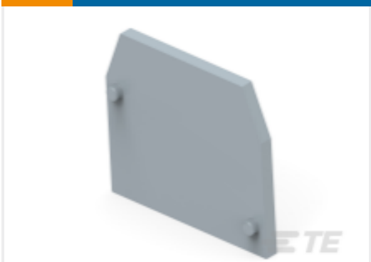
TE Part #1SNA118368R1600 FEM6