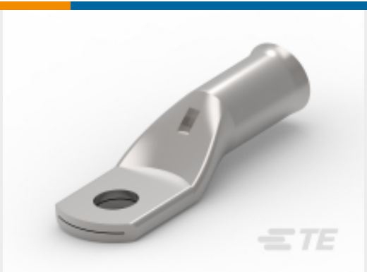
TE Part #710036-4 XCT 35-12