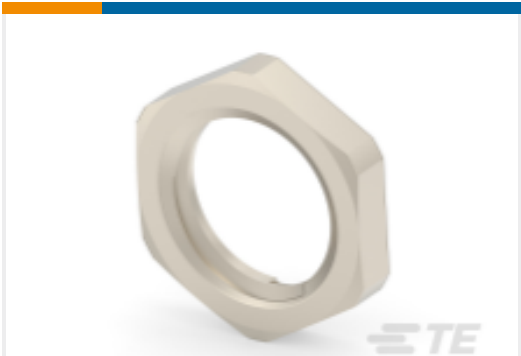
TE Part #1SNG608001R0000 EM-LN-M12-MET-A