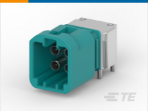
TE Part #2304168-9 4P MATE-AX, HDR ASSY,90 DEG,COD Z