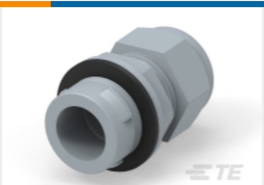
TE Part #1SNG622026R0000 EP-SIG-SZ32-GR-A