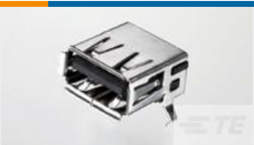
TE Part #292303-1 Std USB Type A, R/A, T/H