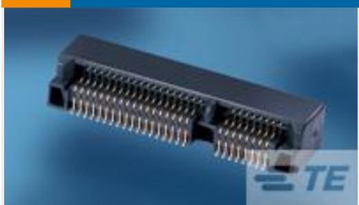
TE Part #1775838-2 mSATA/mini PCI-E 5.6H Type I G/F