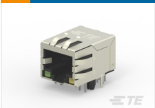
TE Part #1-2301994-0 RJ45 JACK INT.MAG. 1GB LED 1X1