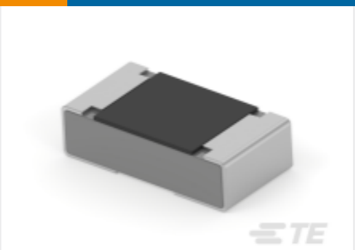
TE Part #2-2176480-6 RA73F 1J 1K0 0.1% 5K RL