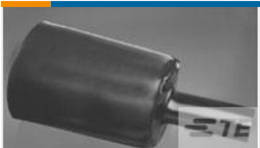
TE Part #CX6254-000 RHW-34/8-1200/ADH-0