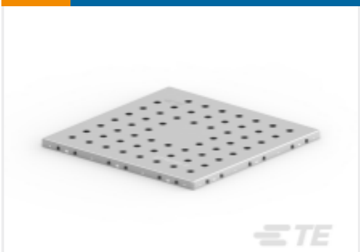
TE Part #2118725-2 STD SHIELD COVER, CRS-44.97X44.97X2.00MM