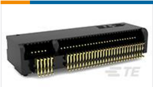
TE Part #1-2199230-6 M.2 0.5PITCH 4.2H KEY M 30U AU