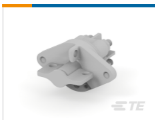
TE Part # CAT-AL4-SBD352002 Battery Disconnect, 200A, 2 Pole