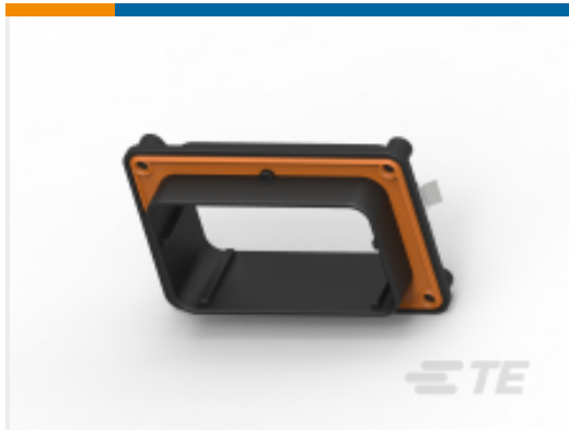
TE Part #DRBF-1A FLANGE, MOUNT, 102/128P, BLK, A