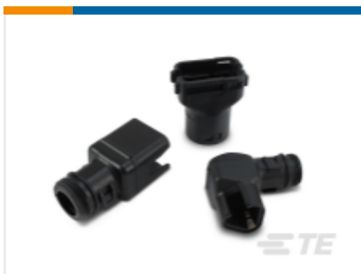
TE Part #1011-263-0405 DEUTSCH DT Backshells