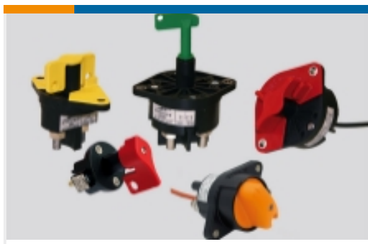
Battery Disconnect Switches(164)