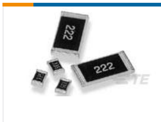
TE Part #1622826-4 CRG0402 5% 10K