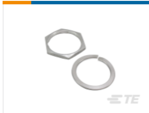
TE Part #114020-90 Mounting Hardware for DEUTSCH HD30 Connectors