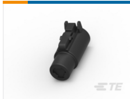
TE Part #DTHD06-1-8S PLG, 1P, BLK, N, SIZE 8