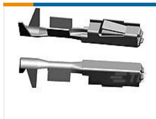
TE Part #5-965906-5 MMS0,63 Au rec LL EDS 0,5-0,75