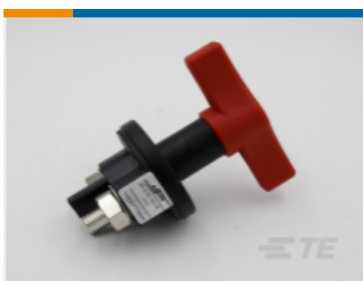
TE Part # CAT-AL4-SBD352001 Battery Disconnect, 200A, 1 Pole