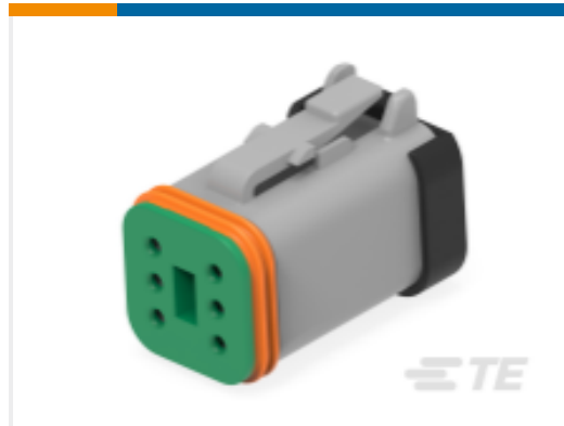
TE Part #DT06-6S-C017 PLG, 6P, GRY, BLOCKED