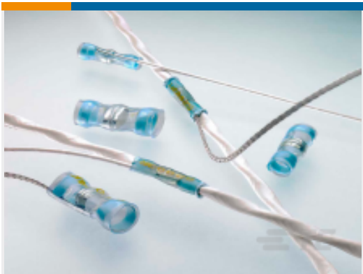
TE Part #CJ8362-000 S200-4-W2-22-9