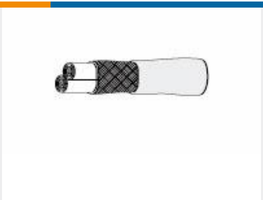
TE Part #169311-000 55A1822-24-9/96-9CS2275