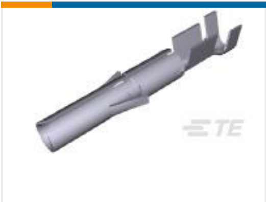
TE Part #350570-6 UMNL SOK 24-18 AUPHBZ