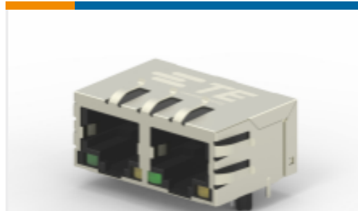
TE Part #2301996-8 RJ45 JACK INT.MAG. 1GB LED 1X2