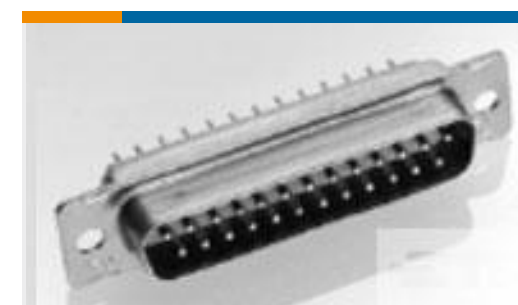
TE Part #204511-1 AMPLIMITE,ASY,PLUG,STD,90,6