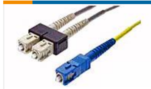
TE Part #6828100-1 FOCK, TJ-SC, SIMPLEX, SM