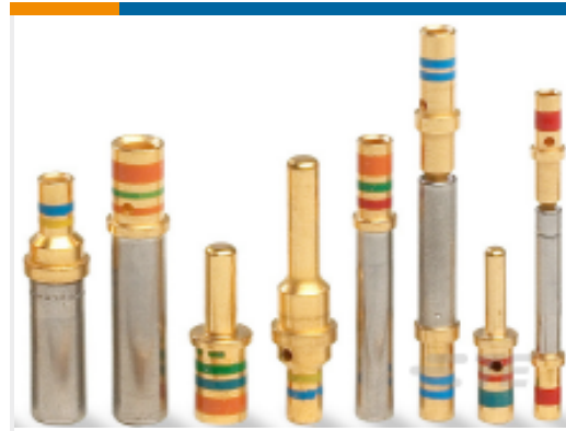
TE Part #2562-214-2031 CONT SOC ASSY