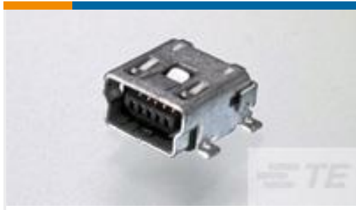
TE Part #1-1734035-1 MINI USB, TYPE B, R/A, SMT