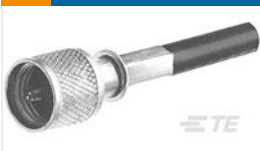
TE Part #226600-1 UHF PLUG-MINIATURE