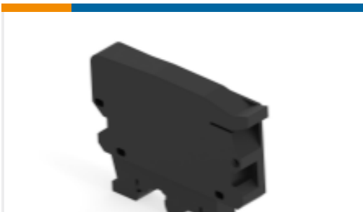
TE Part #1SNA199095R1300 ML10/13.SF