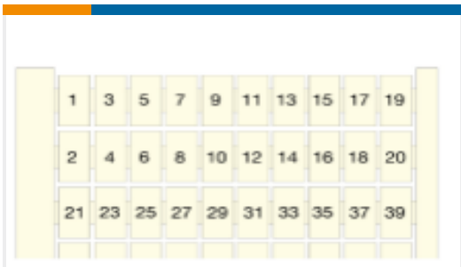
TE Part #1SNA231030R2400 RC510 1->100 HORIZONTAL