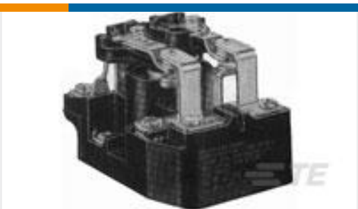
TE Part #1-1393127-6 PRD-11AH0-120=PRD