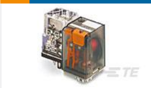
TE Part #1393105-3 KRPA-5DG-12=KRPA