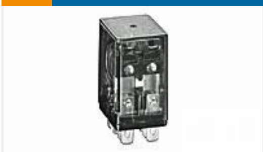
TE Part #5-1393144-9 K10P-11D15-48=K10/K20