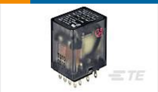
TE Part #2-1393122-8 KHAU-17A12-120=KH