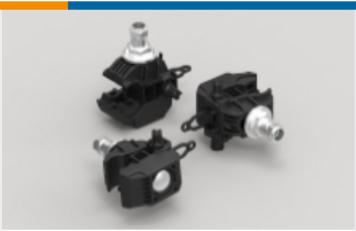
Insulation Piercing Connectors(2)