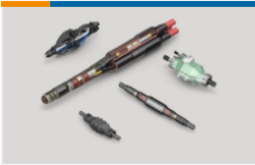
Joints & Splices(4)