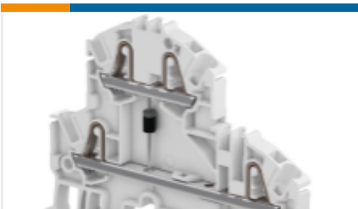
TE Part #1SNK705214R0000 ZK2.5-D-CH-DU